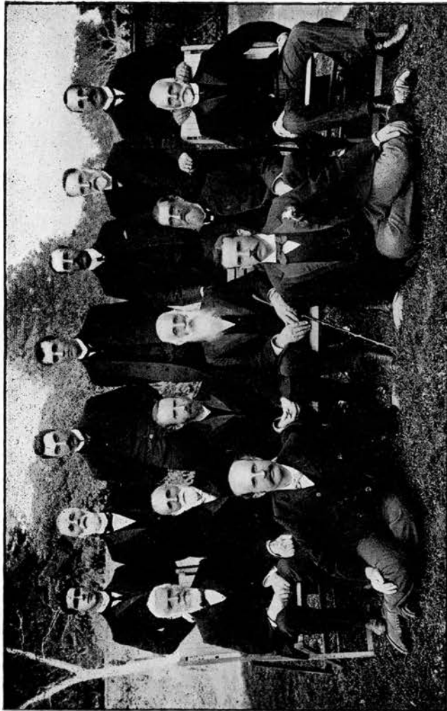
Board of Management, 1905.