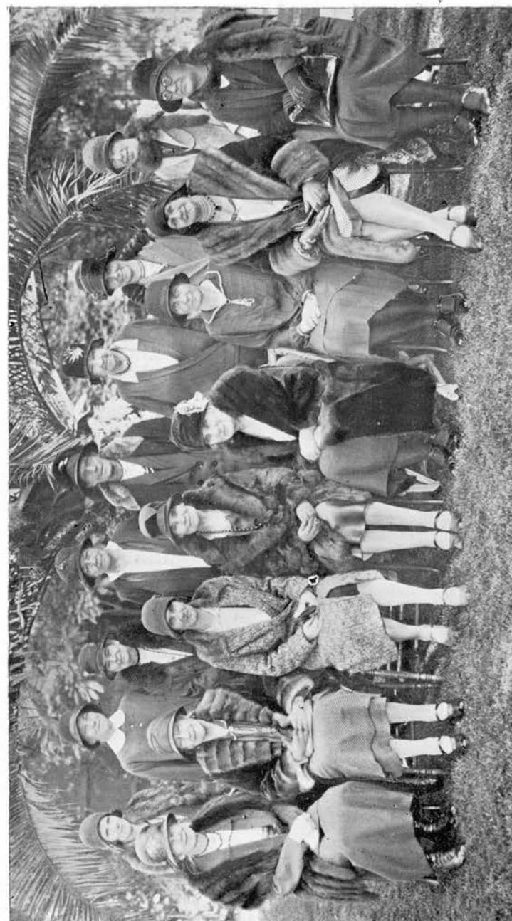
Ladies' Guild, 1930.