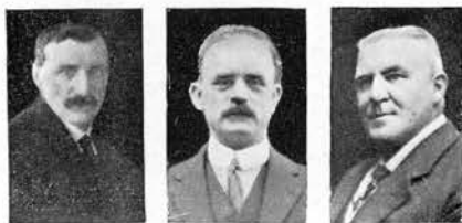
Members of Board of Management, 1930.

Nor would this short history be complete without reference to the Church Officers. They have been a goodly succession—