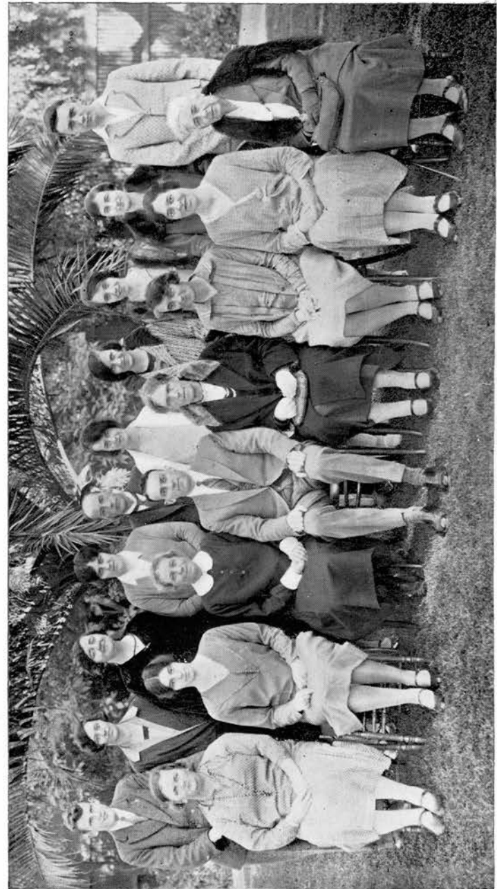
Sunday School Teachers and Officers, 1930.