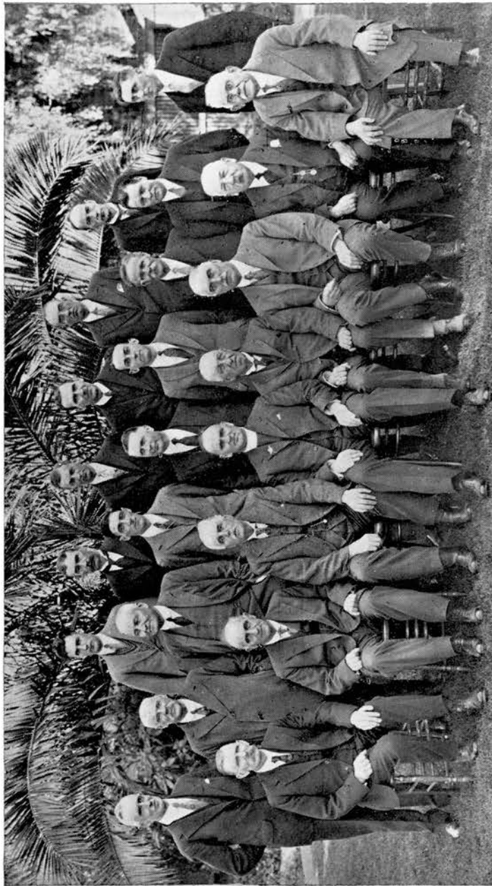
Board of Management, 1930.