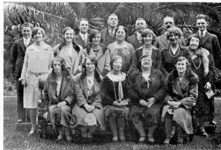
The Choir, 1930.